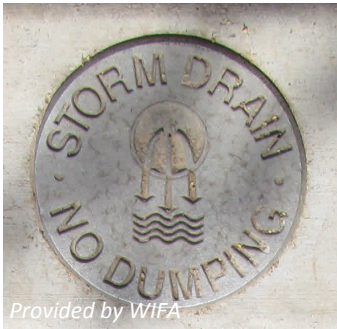
Provided by WIFA